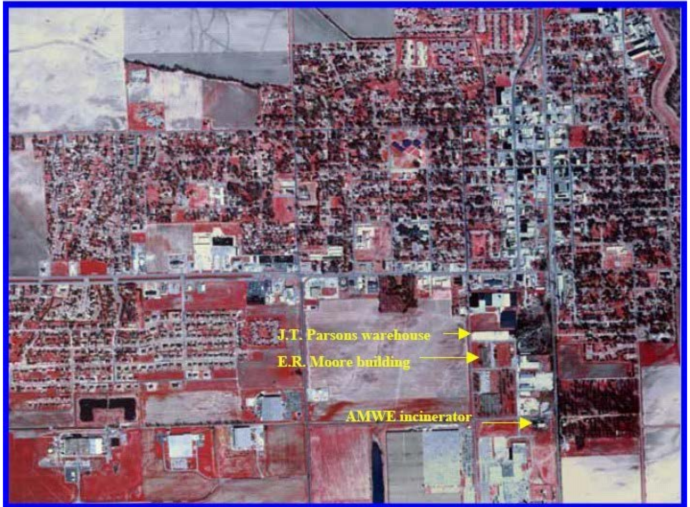
Aerial Photo: AMWE Facilities - Osceola, Arkansas